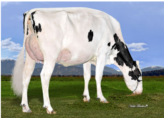
DICKLANDS KING DOC 3503 DAM