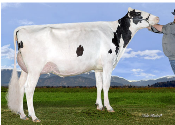
DICKLANDS KING DOC 3503 DAM