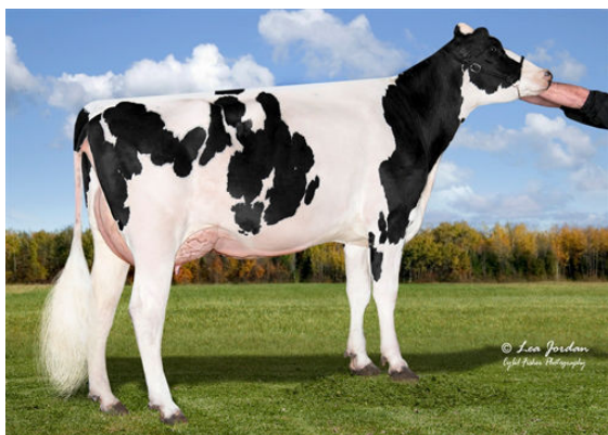
COOKIECUTTER SLM HOPLITE