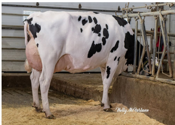
PROGENESIS JEDI MENACE GRANDDAM

EKSTERIØR G Besætninger G Døtre 82% skh. GPA 24*DEC