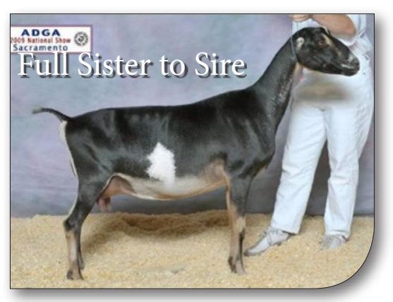
For further information, contact: 7660 Mill Road, Guelph, ON N1H 6J1