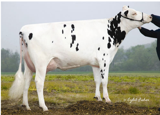
ART-ACRES KAY721 FIFTH DAM