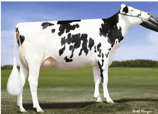
MS C-HAVEN OMAN KOOL FOURTH DAM