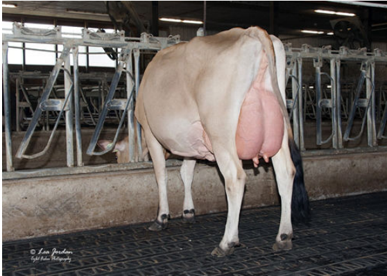
JX RIVER VALLEY ENZO MACNCHEZ 6612 {4} GRANDDAM

PRIMUS COMANCHE KESTREL-P JX RIVER VALLEY THRASHER 2334 {5} JX CDF JLS PILGRIM THRASHER {6} JX RIVER VALLEY ENZO MACNCHEZ 6612 {4} EX-91%-4YR-USA JX CLOVER PATCH AVON ENZO {3} RIVER VALLEY LSTWL MACNCHEZ 5055 EX-91%-3YR-USA