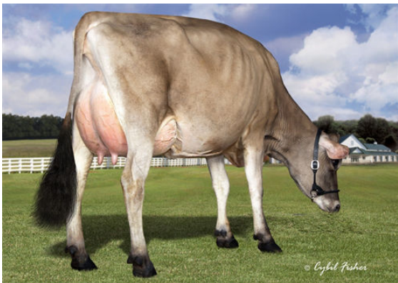
JER-Z-BOYZ MACNCHEZ 48947 FOURTH DAM