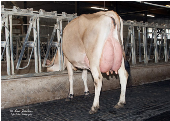
RIVER VALLEY LSTWL MACNCHEZ 5055 GRANDDAM