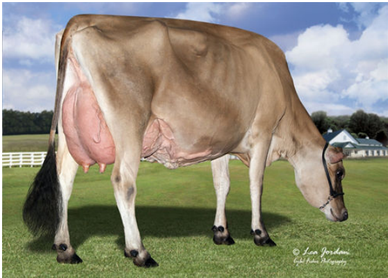
RIVER VALLEY LSTWL MACNCHEZ 5055 GRANDDAM