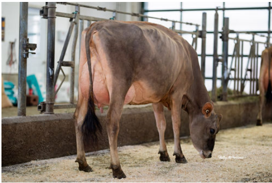
BRIDON PNV VERONICA