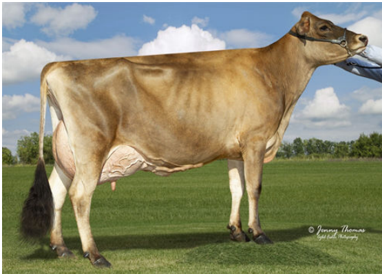
RACHELLES VICEROY LOUISE THIRD DAM