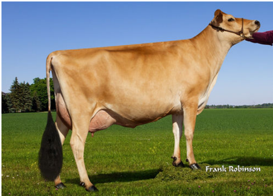
PROGENESIS MADISON- GRANDDAM