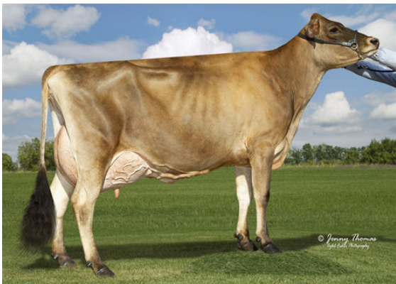
RACHELLES VICEROY LOUISE THIRD DAM