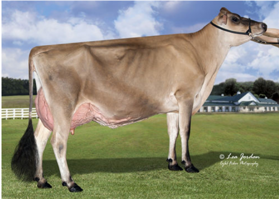
RIVER VALLEY LSTWL MACNCHEZ 5055 GRANDDAM