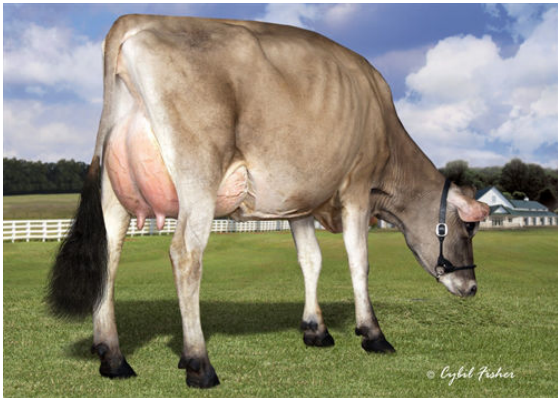
JER-Z-BOYZ MACNCHEZ 48947 THIRD DAM