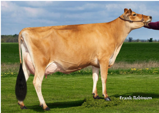
JX VIERRA PRESLEY {6}