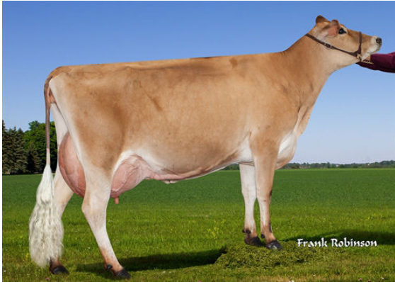
JX VIERRA ELSA {6}

JX OAK LANE EUSEBIO ERICA {5} VG-87%-4YR-USA