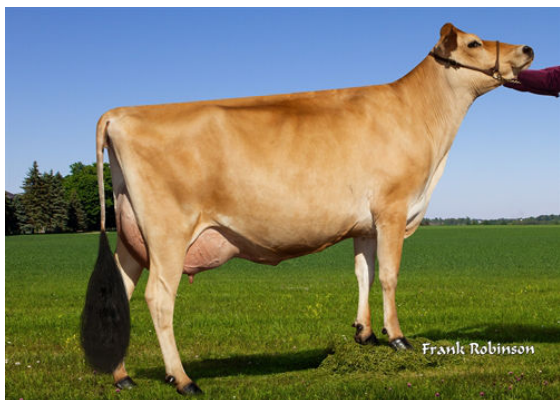
PROGENESIS MADISON- DAM

RIVER VALLEY HERITAGE {6} PROGENESIS MADISON EX-90%-3YR-USA JX RIVER VALLEY CHIEF {6} RACHELLES VICEROY LOUISE VG-88%-6YR-USA CDF VICEROY RACHELLES GENOMINATOR 7857