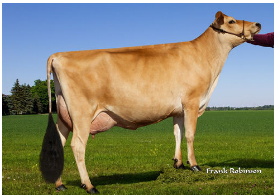
PROGENESIS MADISON- DAM