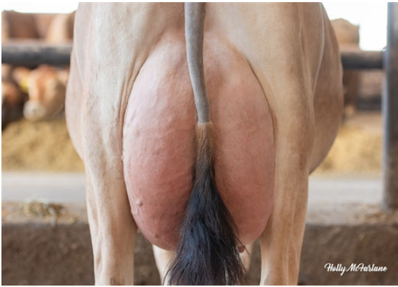
JX PROGENESIS MINNIE {5} DAUGHTER