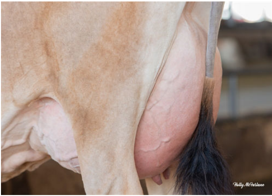
JX PROGENESIS MINNIE {5} DAUGHTER