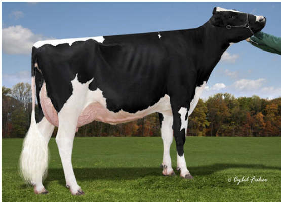
COOKIECUTTER DTA HABITAN FOURTH DAM