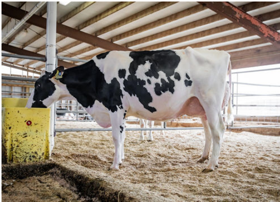
AOT DELUXE HI-LIGHTED DAM