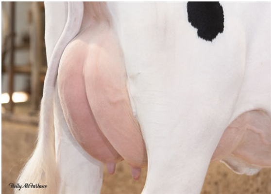
WALNUTLAWN LAMBDA BRIGHT DAM