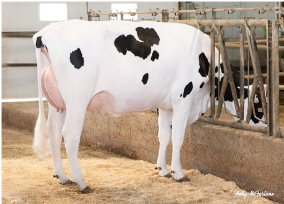
WALNUTLAWN LAMBDA BRIGHT DAM