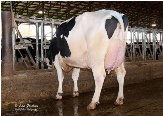
OCD DELTA 33343 FIFTH DAM