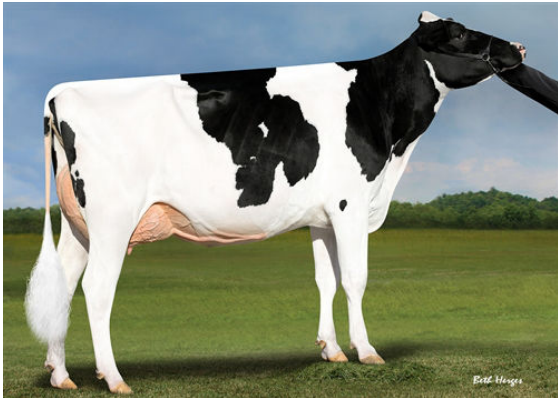
REGAN-DANHOF JEDI CASHMERE FOURTH DAM