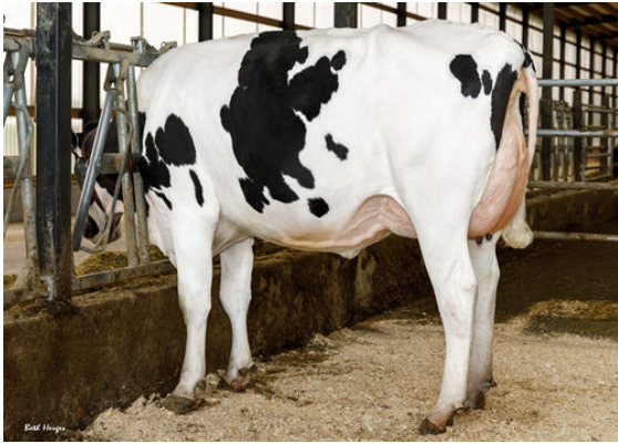
REGAN-DANHOF DELUX CLARE DAM