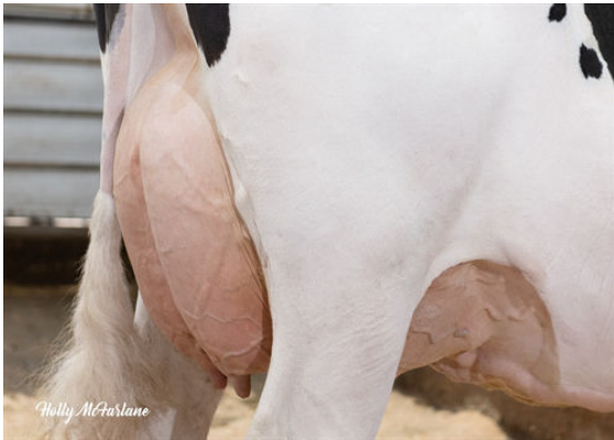
OCD LEGENDARY RAE FOURTH DAM