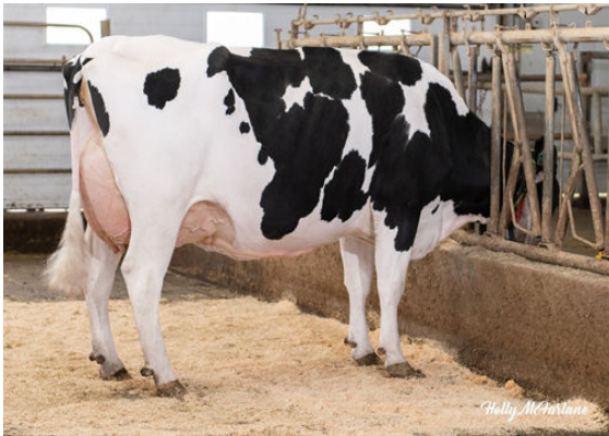
OCD LEGENDARY RAE FOURTH DAM