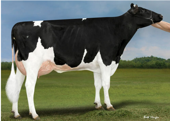
SIMPLE-DREAMS 4825 F2757 FOURTH DAM