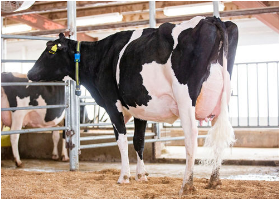
SIEMERS LSTR HANAN 33317 DAM