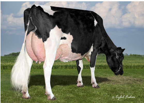
COOKIECUTTER MOG HANKER FOURTH DAM