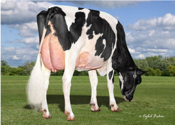
SIEMERS DOC HANAN 28286 GRANDDAM