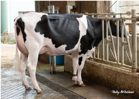
COOKIECUTTER FANCA HOCCO DAM