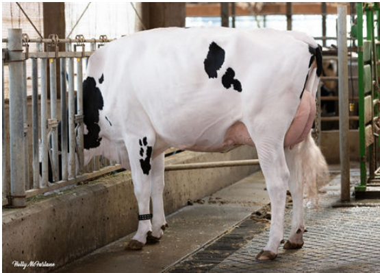
WESTCOAST ASHBY DOCA DAM