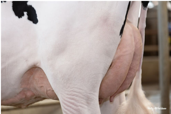
WESTCOAST ASHBY DOCA DAM