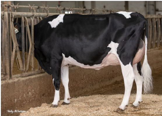
PEAK PLINKO ARLY DAM