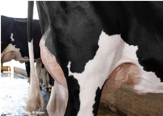
PROGENESIS OUTL WINTERBERRY THIRD DAM