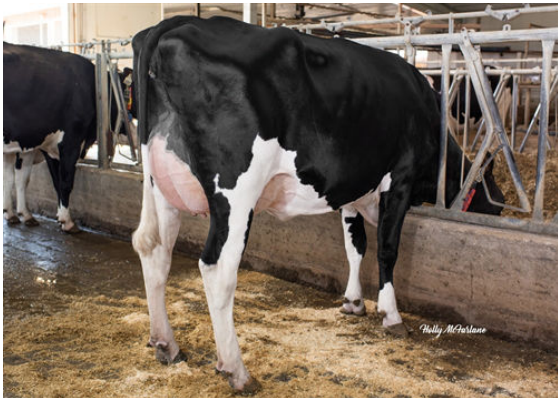
PROGENESIS OUTL WINTERBERRY THIRD DAM