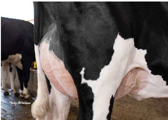
PROGENESIS OUTL WINTERBERRY THIRD DAM