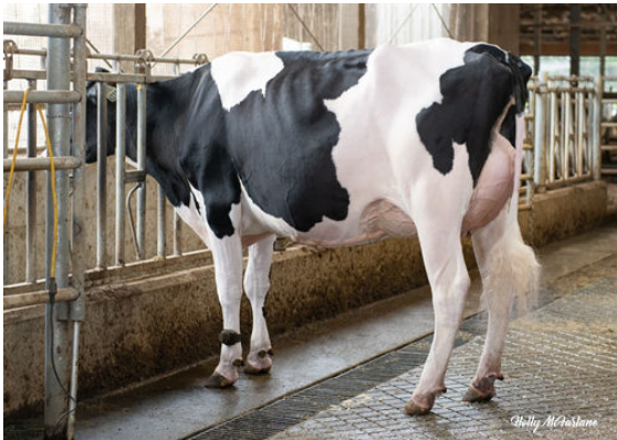
PROGENESIS MONTB ENERGIZER P DAM