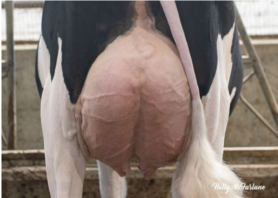
PROGENESIS MONTB ENERGIZER P DAM