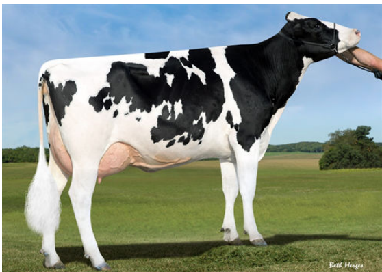
SANDY-VALLEY MORGAN ERA FIFTH DAM