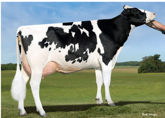
SANDY-VALLEY MORGAN ERA FIFTH DAM