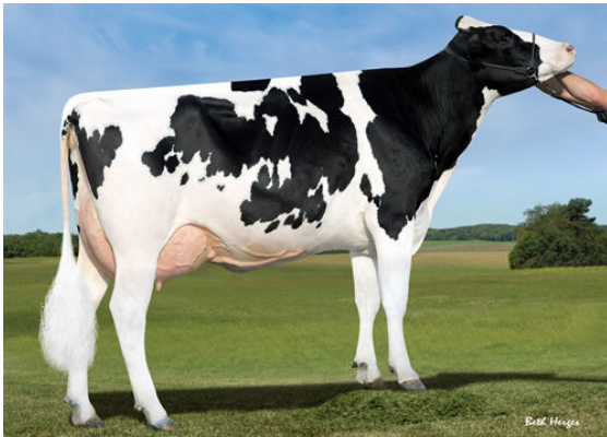
SANDY-VALLEY MORGAN ERA FOURTH DAM