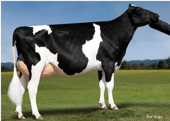
OCD JEDI TAYA 37904 THIRD DAM