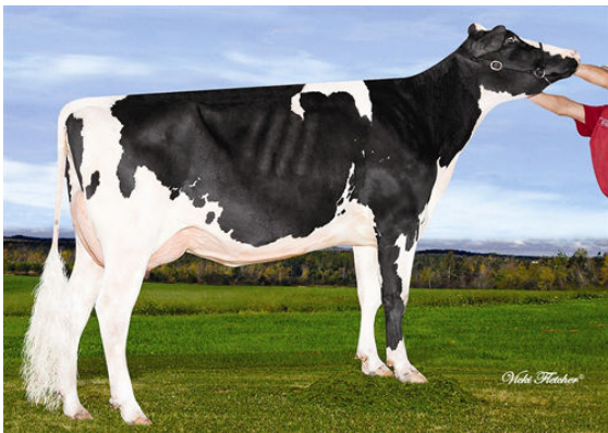
DULET ARMSTEAD KIM 1 FOURTH DAM