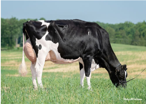
DULET D-LAMBDA KATRINA DAM