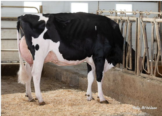
DULET D-LAMBDA KATRINA DAM