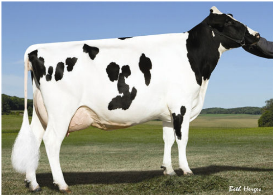
PINE-TREE MONICA PLANETA FIFTH DAM