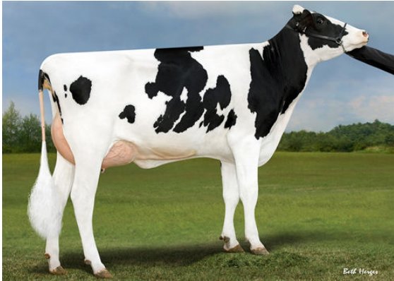
PINE-TREE 7831 LION 598 DAM