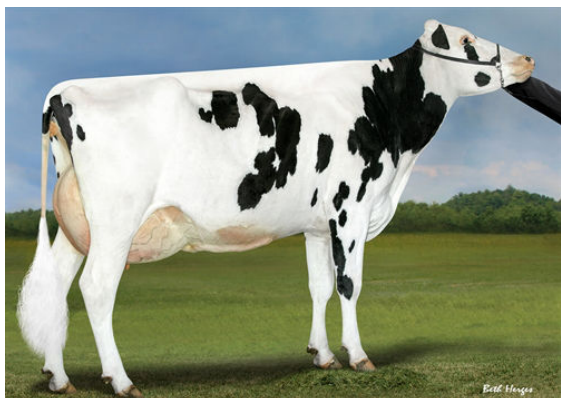
PROGENESIS DUKE MELEE