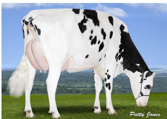
PEAK BOMBERO MAXIMA