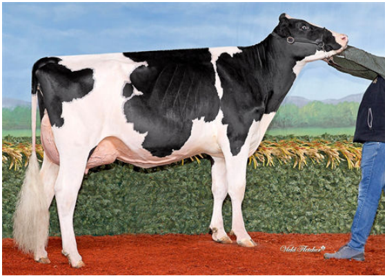
DREWHOLME LAMBDA LEYSURE P DAM