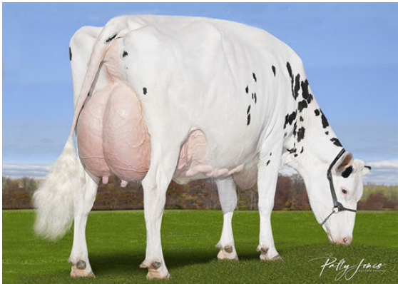
CALBRETT KINGBOY MIRANDA P GRANDDAM