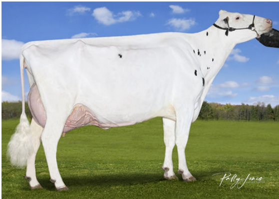
VOGUE LOYOLA MELINDA PP DAM