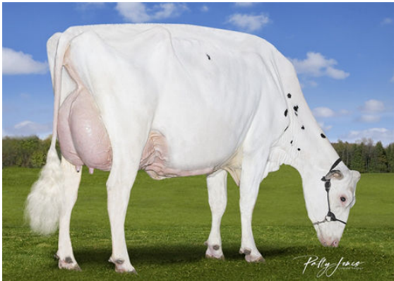
VOGUE LOYOLA MELINDA PP DAM