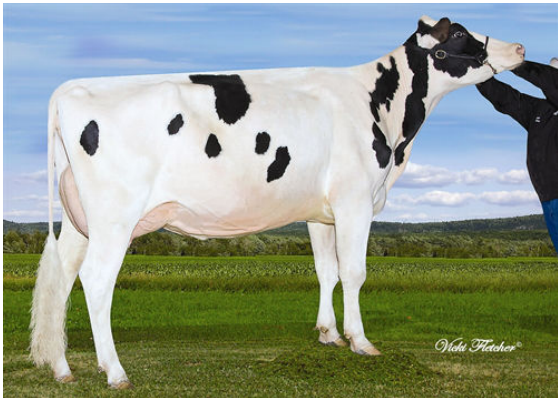
DULET BOLTON KIRPA FIFTH DAM