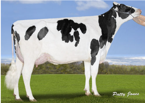
SILVERRIDGE DUKE ELSA-P GRANDDAM