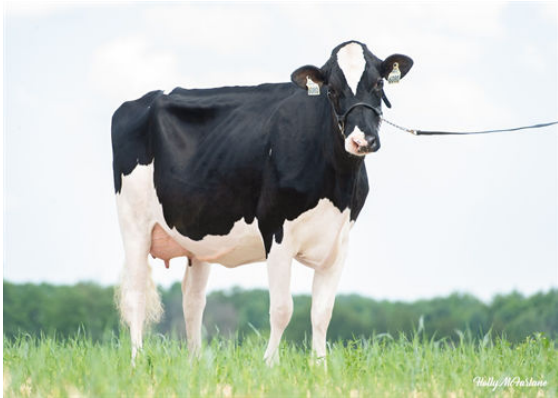
PROGENESIS HIGHJUMP LEADER DAM