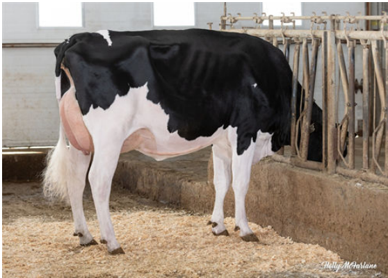
PROGENESIS HIGHJUMP LEADER DAM