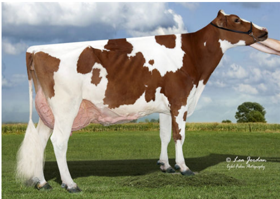
SCENERY-VIEW CELIA-RED FOURTH DAM