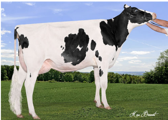
JOSEY-LLC UNO SANGARIA FOURTH DAM