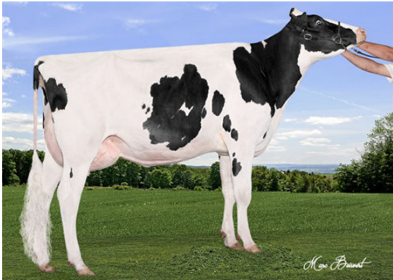
JOSEY-LLC UNO SANGARIA FOURTH DAM