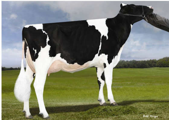
LADYS-MANOR S DAHLIA FIFTH DAM