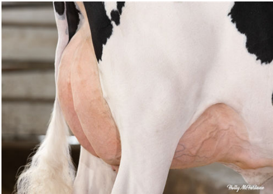
PROGENESIS ZAZZLE TWIGGY DAM