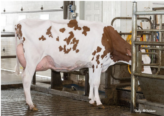
VOGUE MIRAND RED WINE-PP