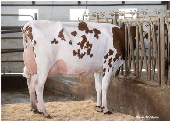
VOGUE MIRAND RED WINE-PP