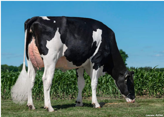
SPERO VALIANT LOTTERYS SIDEPOT DAM