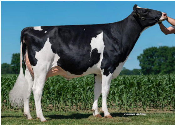
SPERO VALIANT LOTTERYS SIDEPOT DAM