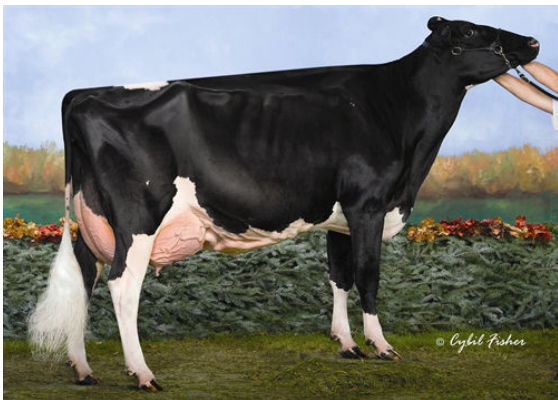
WINTERBAY GOLDWYN LOTTO FOURTH DAM