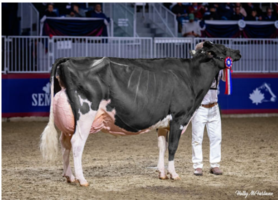
JACOBS HIGH OCTANE BABE DAM