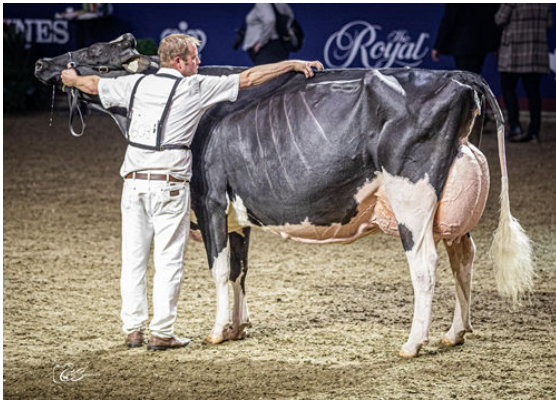
JACOBS HIGH OCTANE BABE DAM