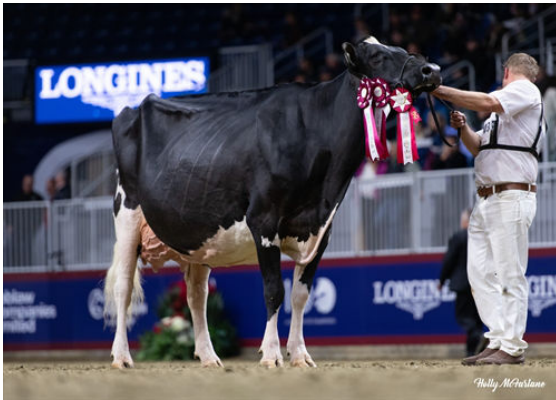
JACOBS HIGH OCTANE BABE DAM