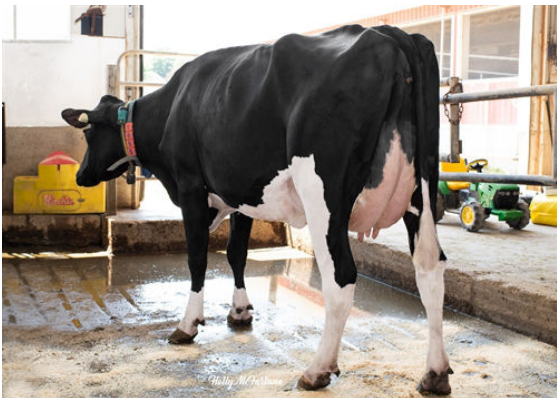
PROGENESIS CHARLEY TULIP THIRD DAM