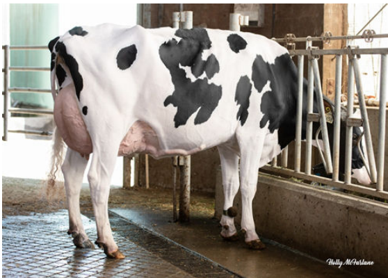
PROGENESIS ZAZZLE RINGSIDE DAM