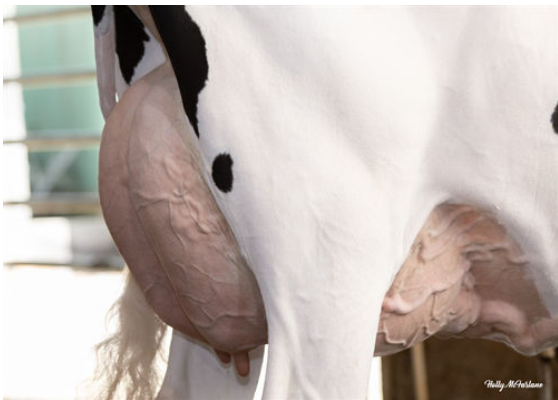
PROGENESIS ZAZZLE RINGSIDE DAM