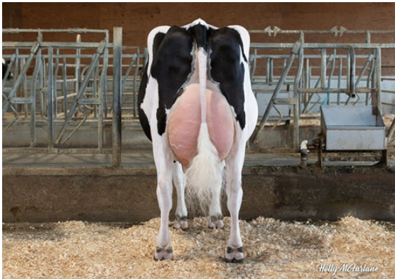
MYSTIQUE LAMBDA ANIS DAM